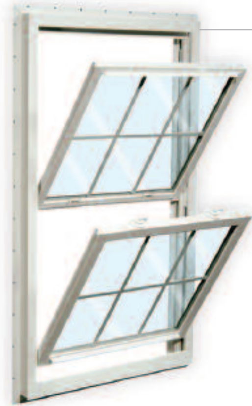
Available colors for all models: White, Almond