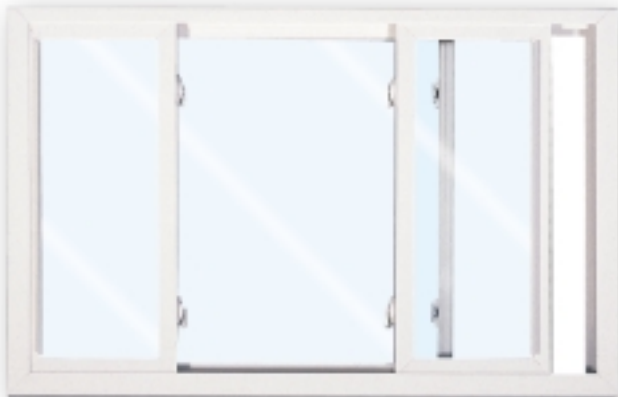
3-Lite Slider Window