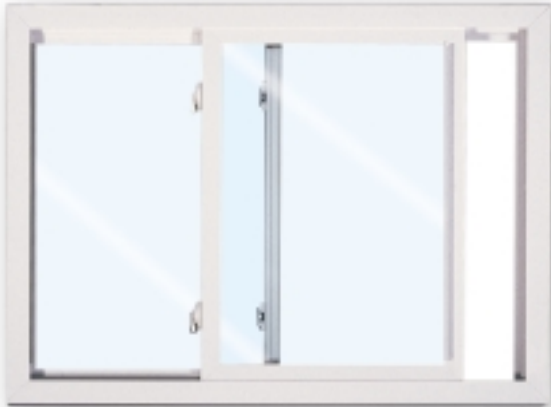
2-Lite Slider Window