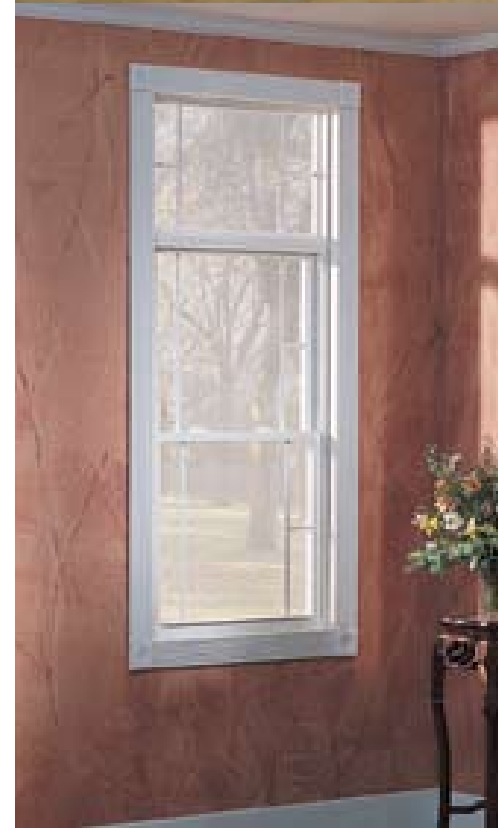
Double-Hung with transom and special grids